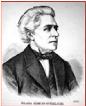
SIR PAUL EDMUND DE STRZELECKI (1797-1873) POLISH ARISTOCRAT, EXPLORER DISCOVERED AUSTRALIA'S HIGHEST MOUNTAIN IN 1840 AND NAMED IT AFTER POLAND'S NATIONAL HERO TADEUSZ KOSCIUSZKO. STRZELECKI'S DESCENDANTS LIVE IN AUSTRALIA.

Today the Polish community is one of the first ethnic communities in the ACT.