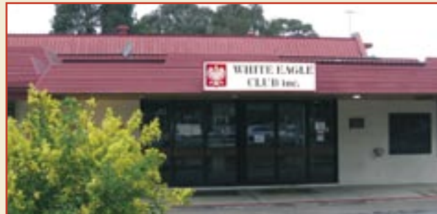
POLISH AUSTRALIAN WHITE EAGLE CLUB, 38 DAVID STREET TURNER ACT 2612

The Polish Australian White Eagle Club in Turner and the Polish Catholic Centre in Narrabundah have premises where the majority of events take place. The Polish Ex-Servicemen's Association has premises in Civic.