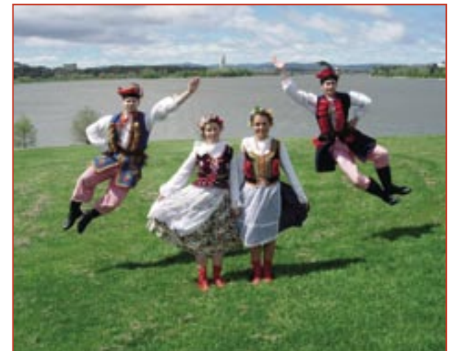
POLISH DANCE GROUP WIELKOPOLSKA

Over the years the community's organisations have significantly contributed to the ACT economy, social life and culture. It has helped to develop a multicultural Canberra from its inception in the early 1950s.