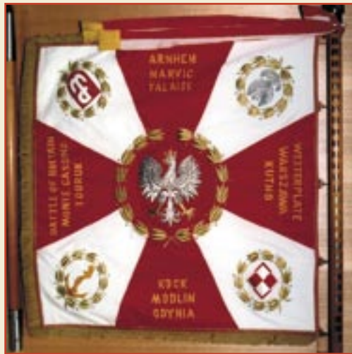
STANDARD OF THE POLISH EX-SERVICEMEN'S ASSOCIATION IN CANBERRA AND DISTRICT INC, SUB-BRANCH NO.5

The Council is frequently asked to represent the Polish-Australian community at diplomatic functions, other events and to host visiting Polish dignitaries, academics and artists. In this respect, it has a close working relationship with the Embassy of the Republic of Poland, other federal/territorial agencies, universities and multicultural bodies in the ACT.