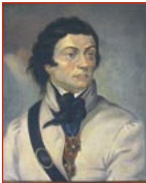
GENERAL TADEUSZ KOSCIUSZKO (1746-1817) ENGINEER, FREEDOM FIGHTER AND CIVIL LIBERTARIAN. HERO OF TWO NATIONS, POLAND AND THE UNITED STATES, HE FOUGHT IN THE WARS FOR THEIR INDEPENDENCE AND IS HONOURED BY THE UNITED STATES, FRANCE AND POLAND.

Images courtesy of the National Portrait Gallery, Canberra and the Embassy of the Republic of Poland in Canberra